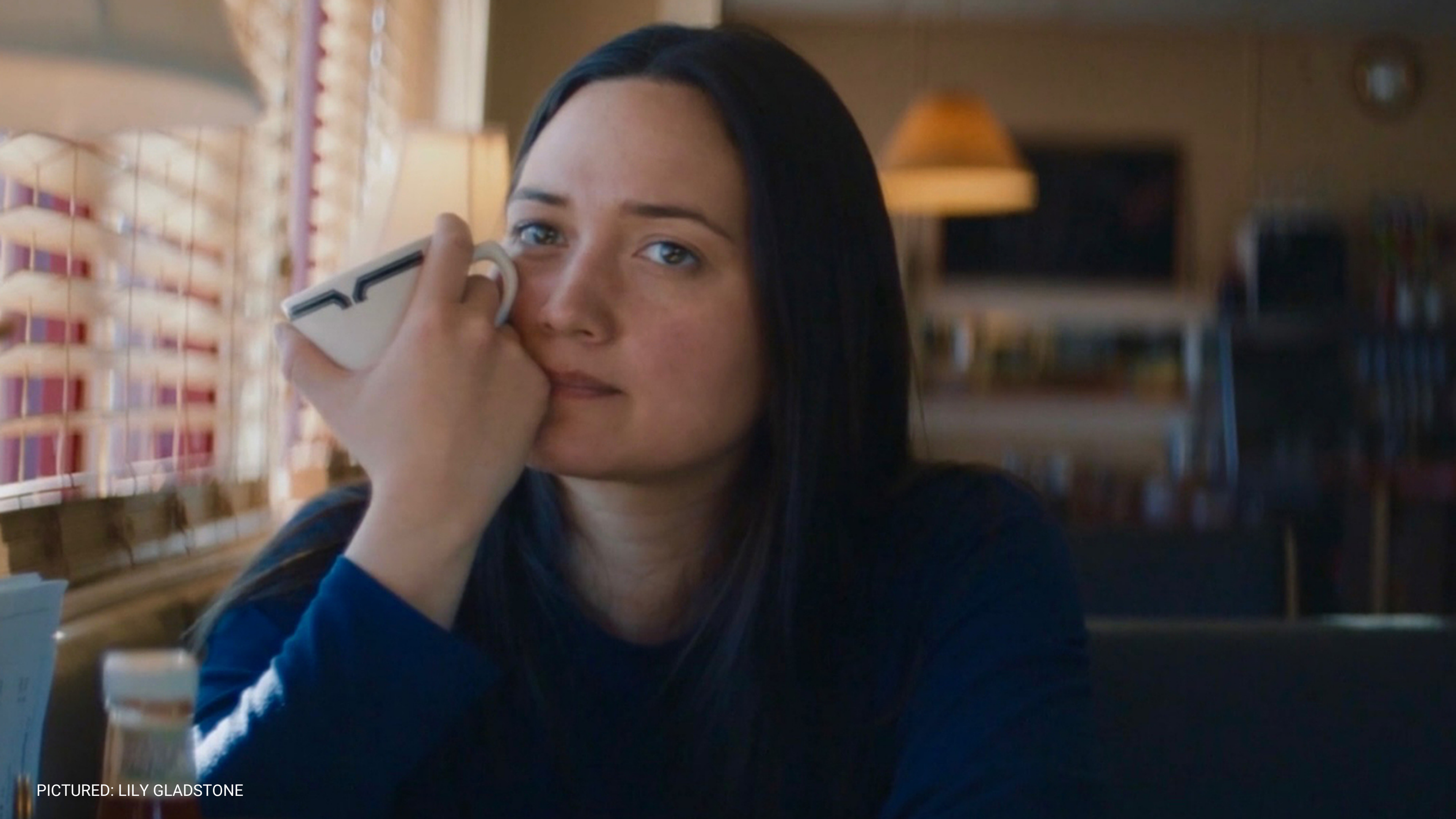
PICTURED: LILY GLADSTONE