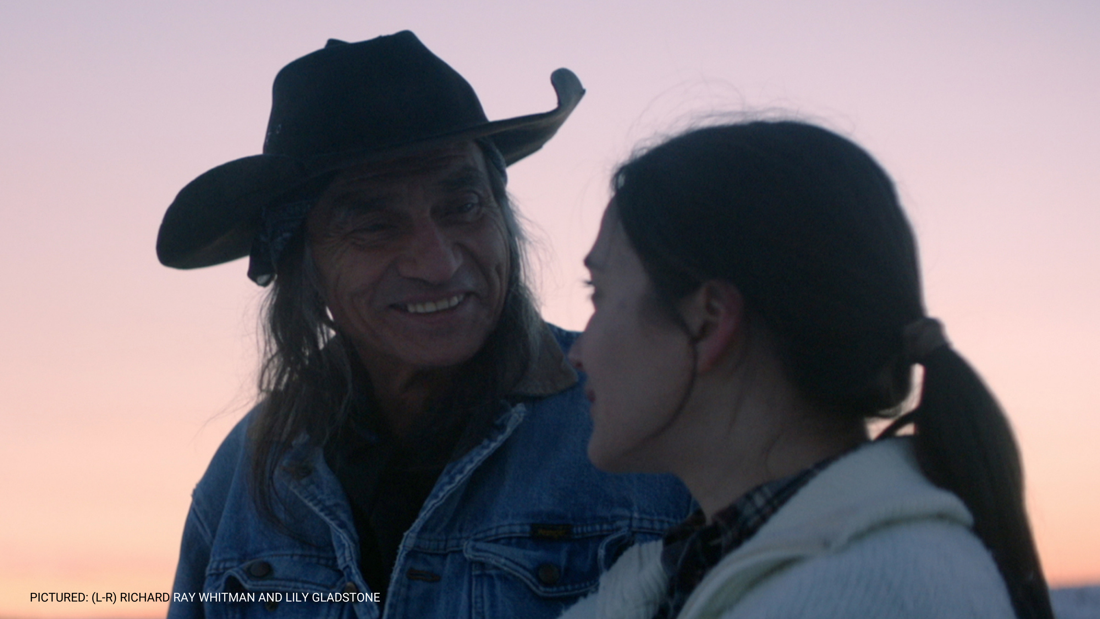
PICTURED: (L-R) RICHARD RAY WHITMAN AND LILY GLADSTONE