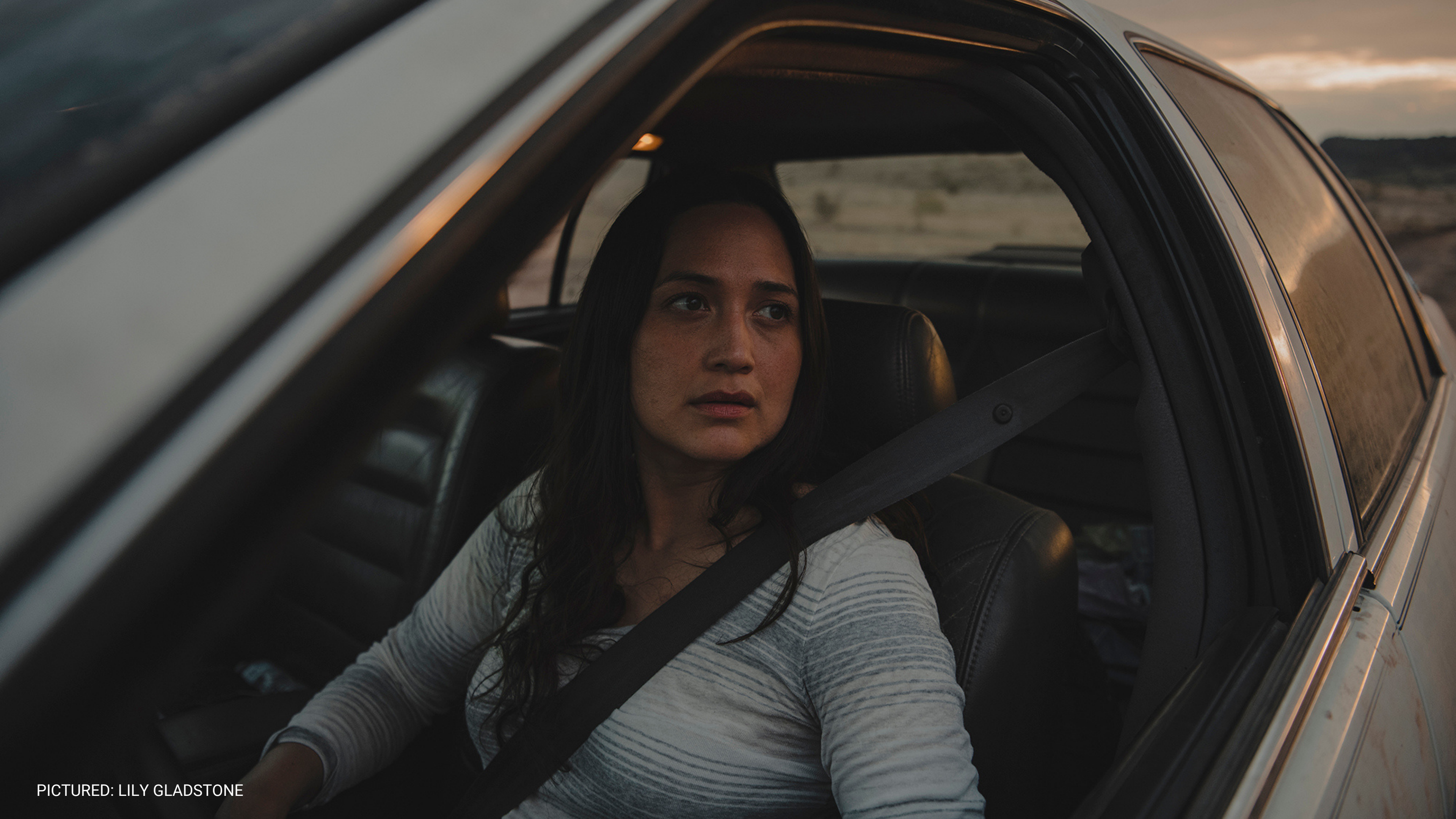
PICTURED: LILY GLADSTONE