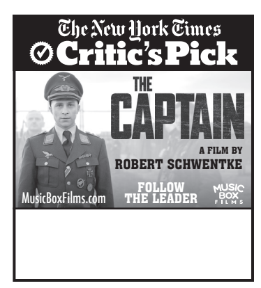
1col(1.8) \times 2" = 2"