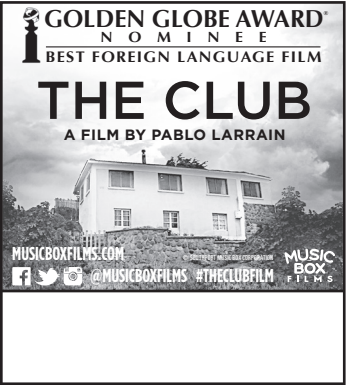
1col (1.8”) x 2” = 2” B