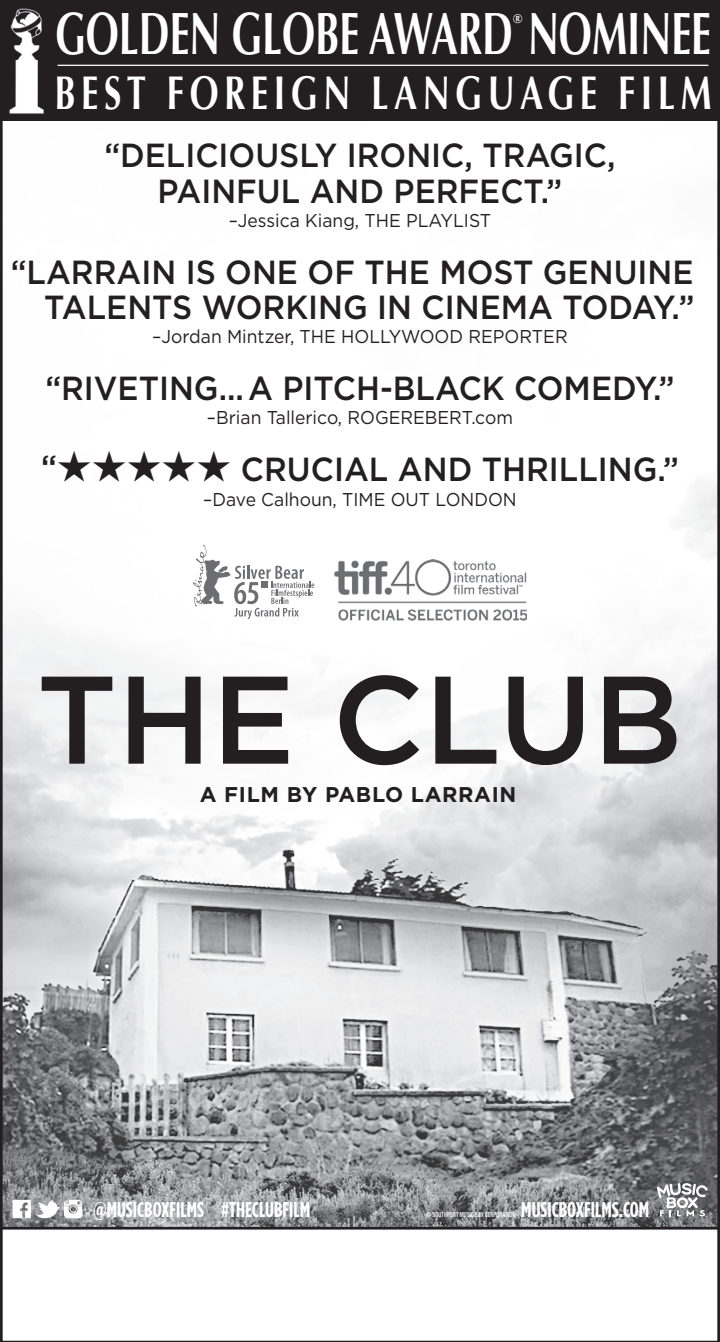
2col (3.75”) x 7” = 14”