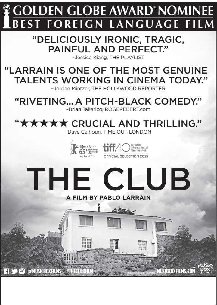
2col (3.75”) x 5.25” = 10.5”