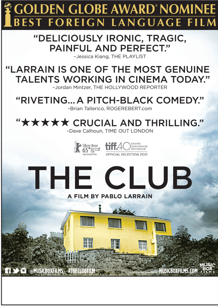
2col (3.75”) x 5.25” = 10.5” 4C