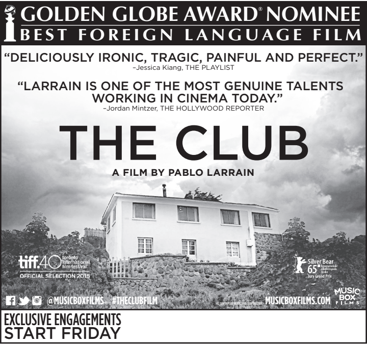
2col (3.75”) x 3.5” = 7”