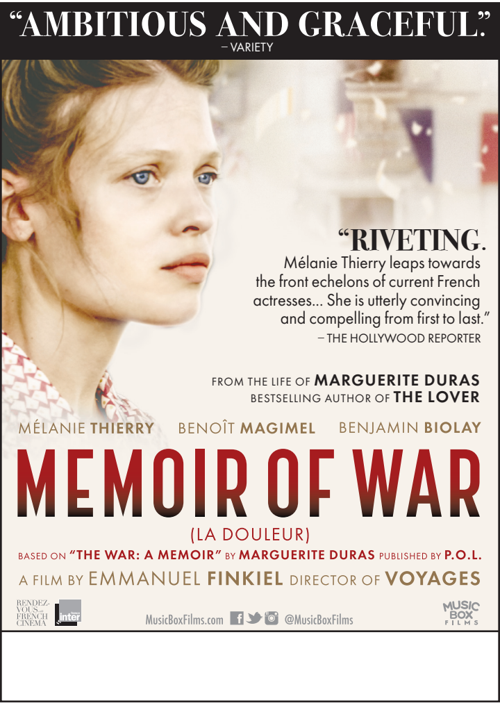
2col (3.75”) x 5.25” 4C