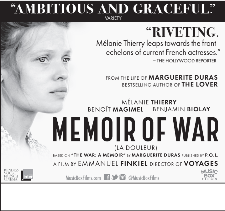
2col (3.75”) x 3.5”