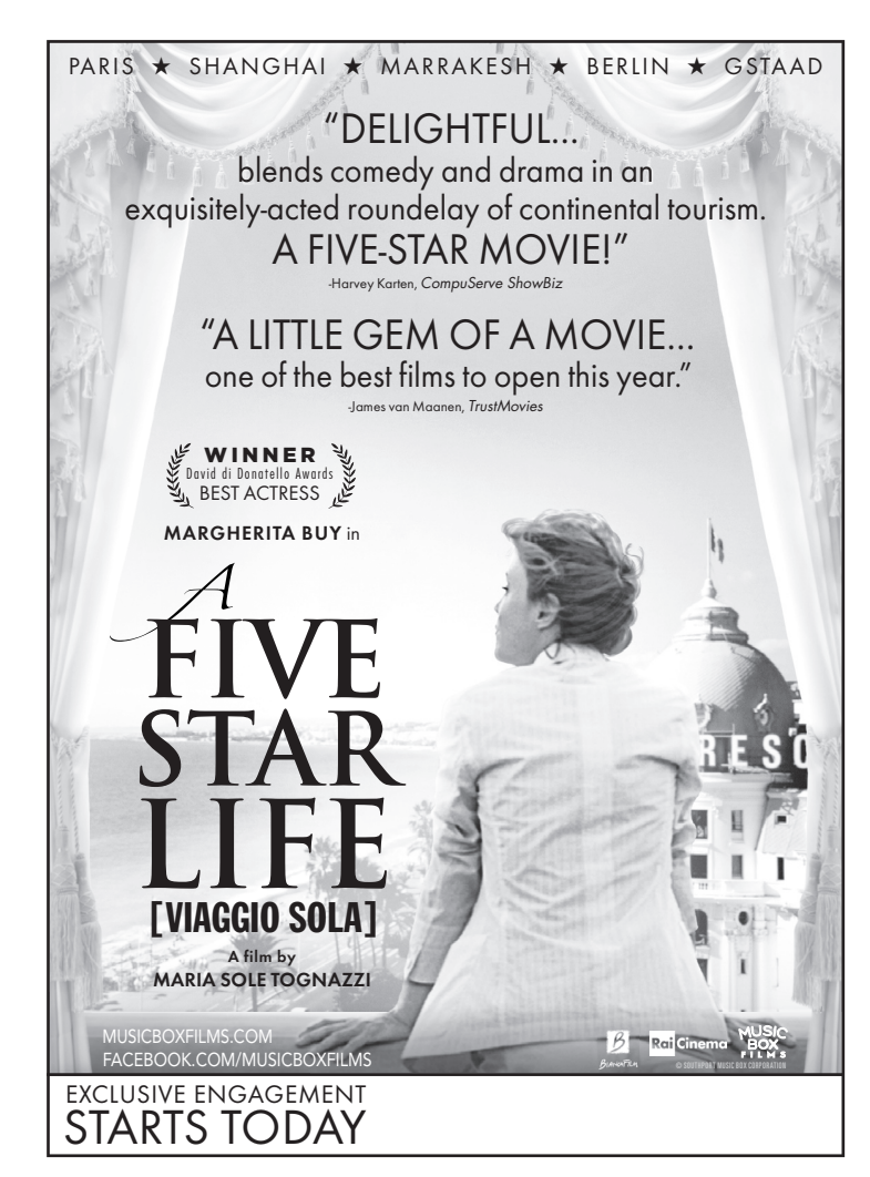
2col(3.75") \times 5.25" = 10.5"