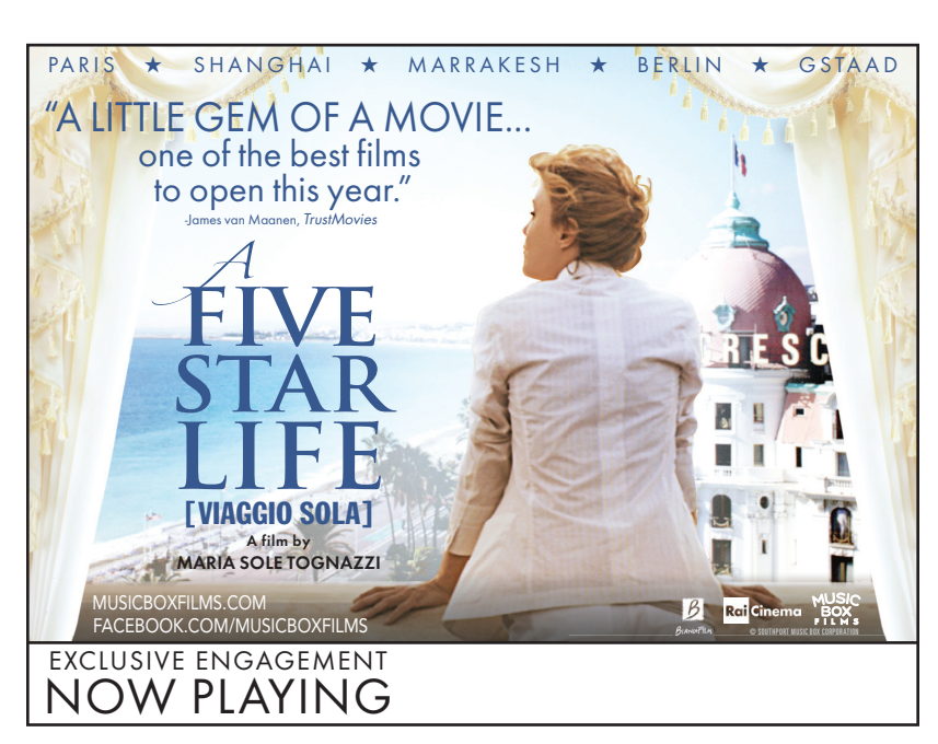
4.25" x 3.25" 4C