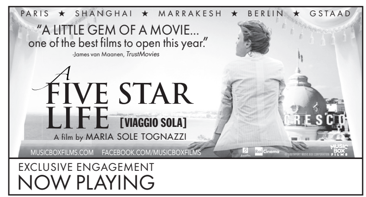
2col (3.75") x 2"