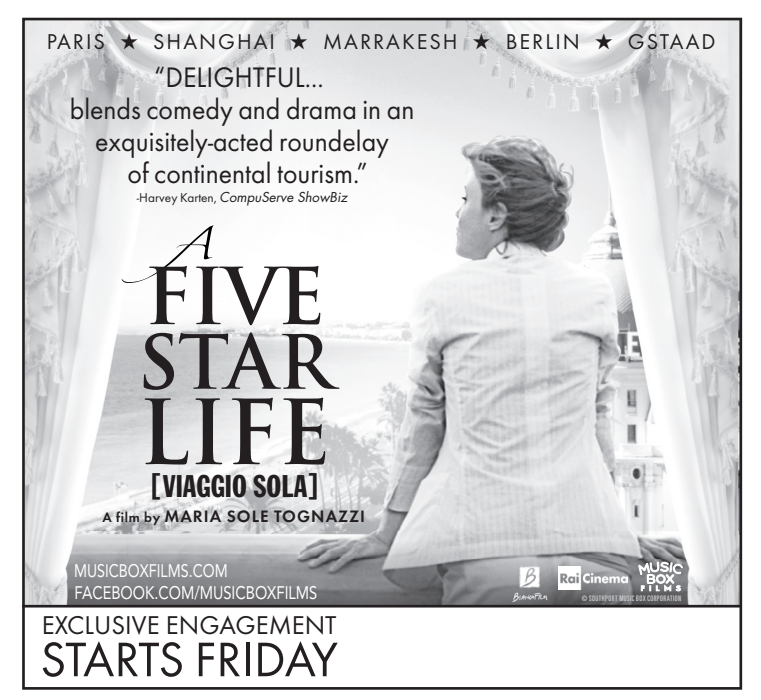
2col(3.75") \times 3.5" = 7"